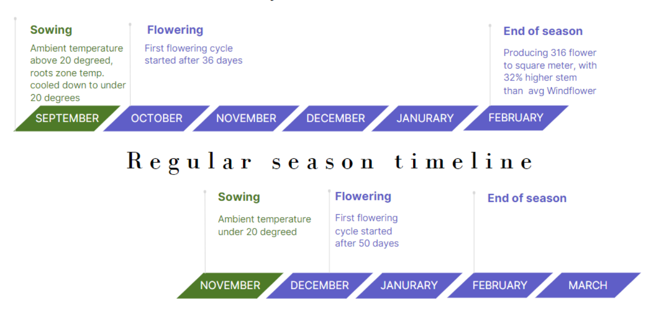
Figure 2: The timeline for the growing cycle with the ROOTS system (above) and without it (below). The growing cycle starts two months earlier using the ROOTS system and ends one month earlier.