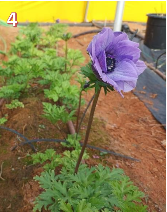
Photos 3 and 4: First bud on 3.10 days after planting and first Windflower bloom on 10.10