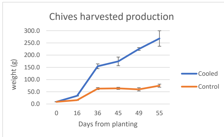
Cooled chives plants (blue) continued growing for 55 days while uncooled plants (orange) virtually stopped growing after 36 days.