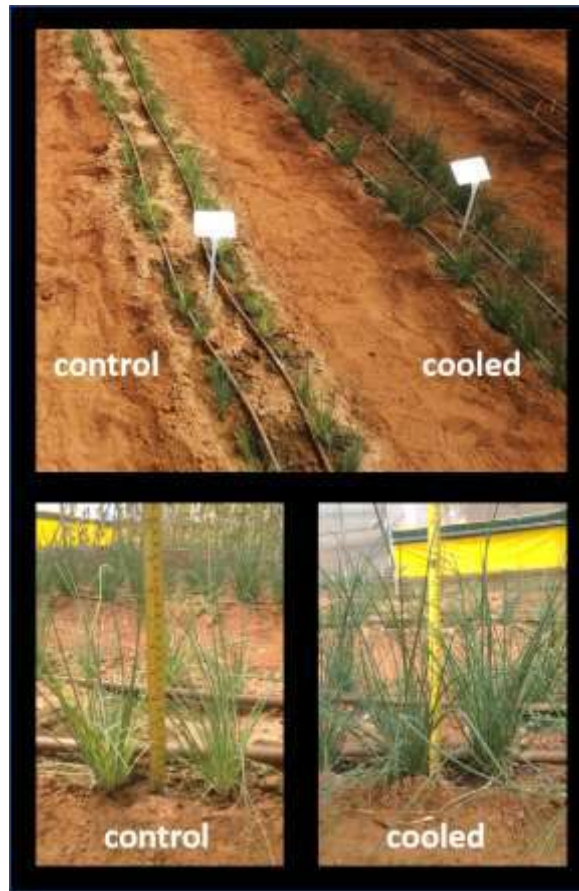
RZTO cooling technology increased the average weight of chives by 257 percent compared to control crops.