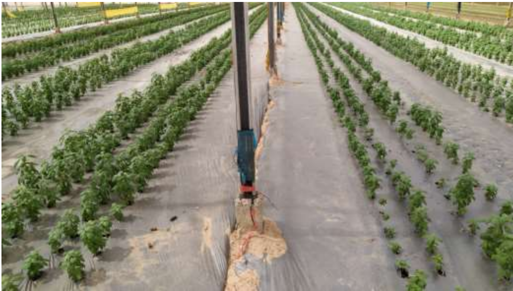
RZTO cooled basil crop (left) vs uncooled basil crop at a commercial farm in the Arava desert, Israel

“RZTO offers options for producers’ with increased planting cycles during traditional off-seasons and provides significant savings on energy costs when compared to commonly used air heating and cooling systems.